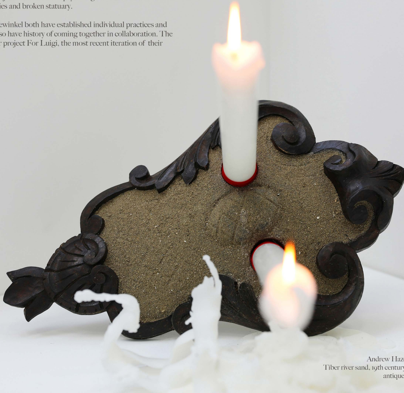
Andrew Hazewinkel - Untitled (For Luigi) - 2025 Tiber river sand, 19th century wooden ornament, church candles, antique damask 50.4 x 42 x 90 cm (variable)

Jelena Telecki and Andrew Hazewinkel both have established individual practices and rich exhibition histories. They also have history of coming together in collaboration. The following images document their project For Luigi, the most recent iteration of their ongoing collaboration.