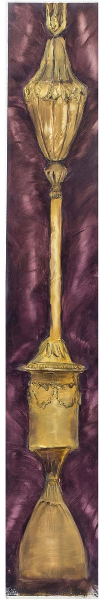
Jelena Telecki - From the series Lacrime - 2025 - oil on polyester, each 12 x 65 cm (studio doumentation)