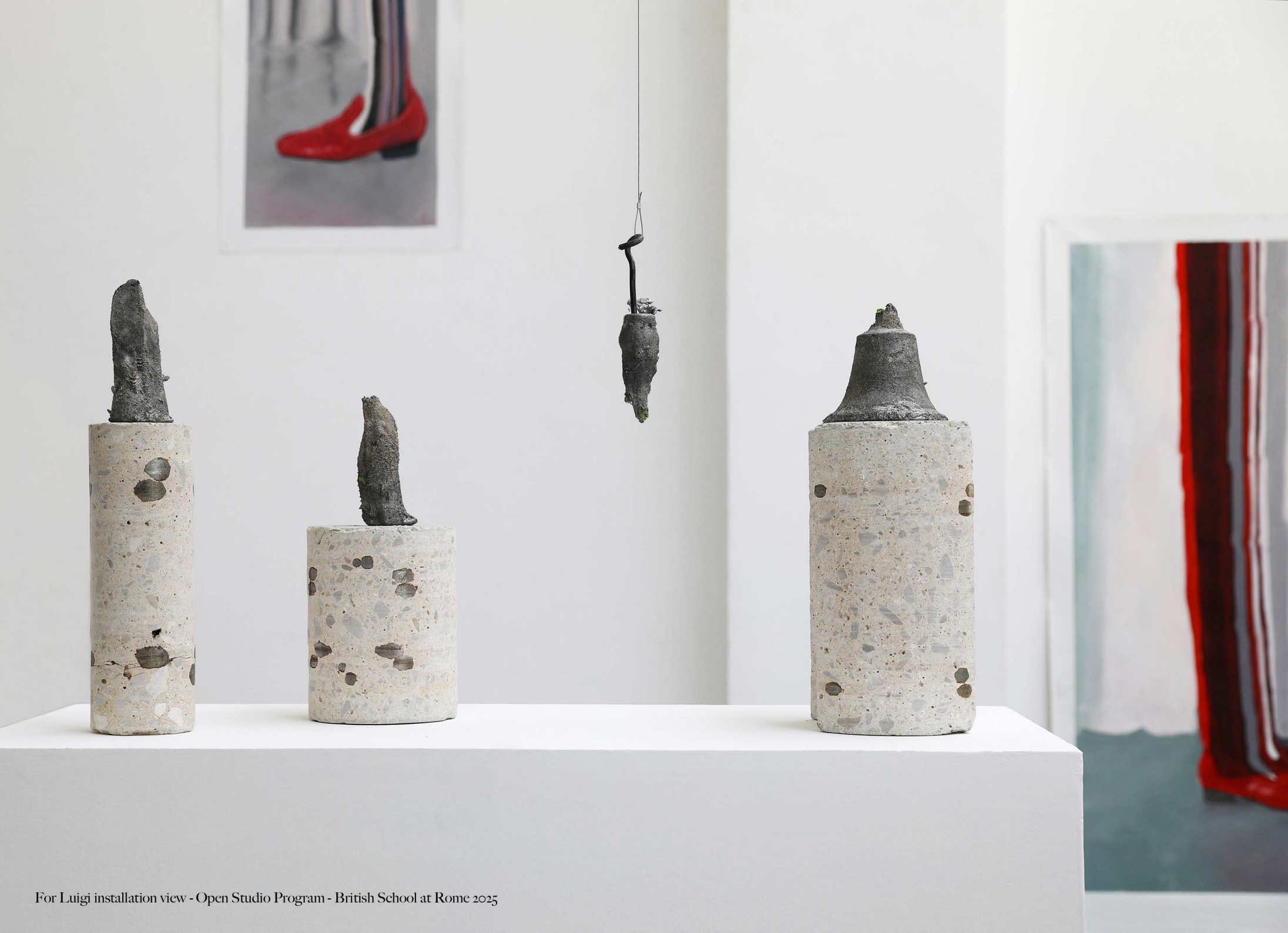
For Luigi installation view - Open Studio Program - British School at Rome 2025