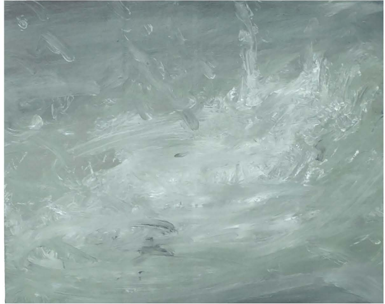
Jelena Telecki - Tevere 2 - 2025 - oil on polyester 35 x 45 cm