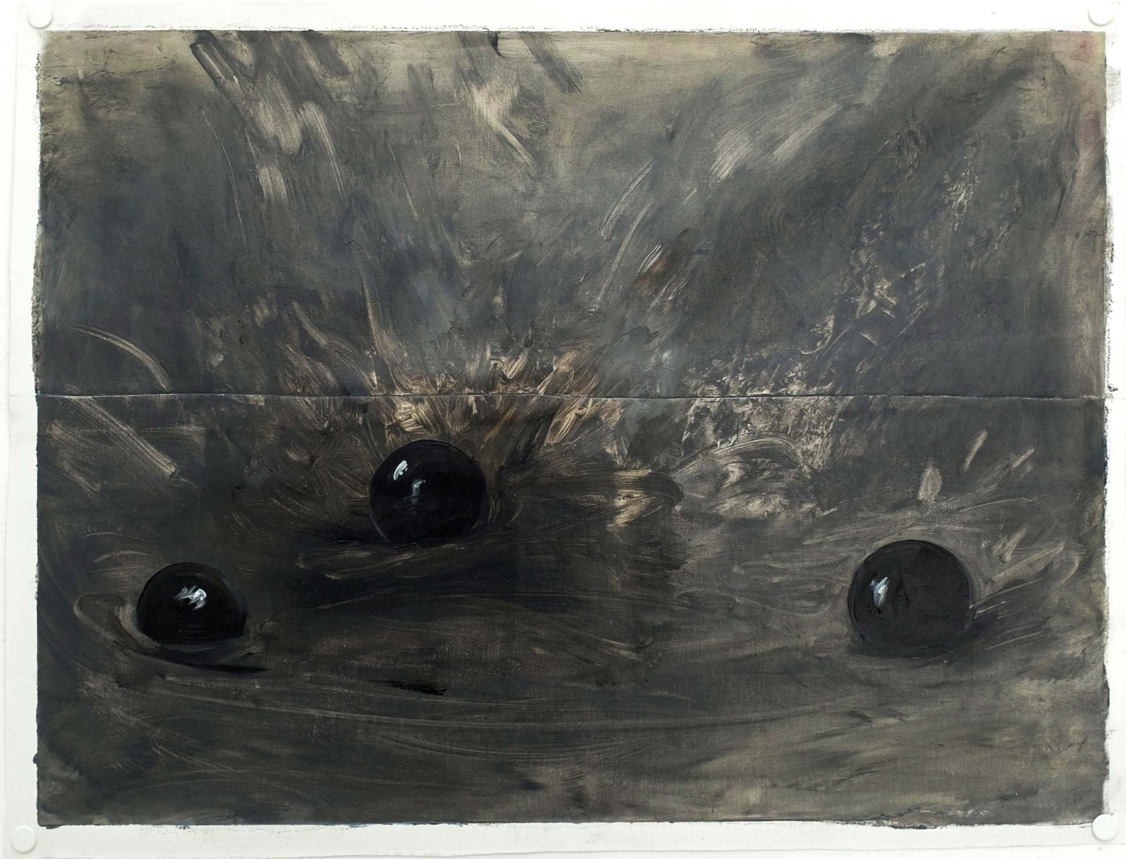
Jelena Telecki - Tevere 1 - 2025 - oil on polyester, 46 x 22 cm